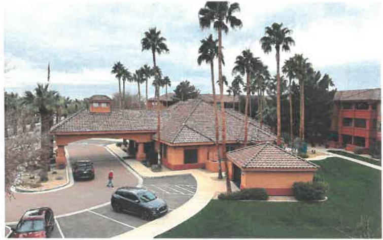
View from condo balcony.

Adrienne Kirschner, unit 3312 623-466-9068 adriennekirschner314@gmail.com